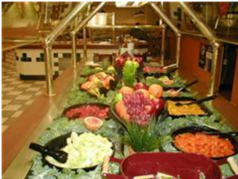
The format covers all meal types: breakfasts, sandwiches, entrees, salads, sides and desserts.